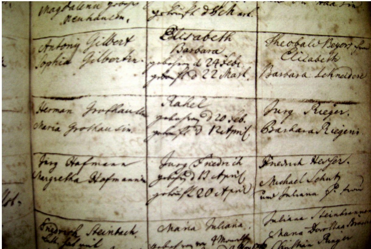
The Second Complete Entry:

Original Page 79; by later enumeration, Page 77; the year 1747