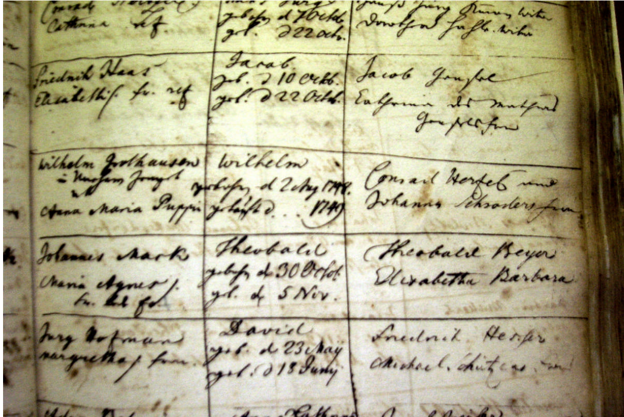
The Second Complete Entry: